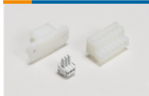
Card Edge Connector Housings(2)