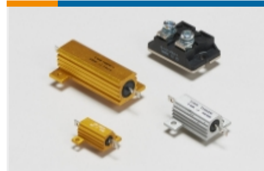
Chassis Mount Resistors(535)