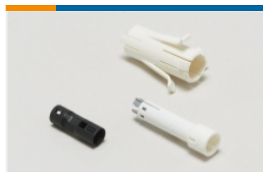
Plug & Socket Lighting Connector Accessories(1)