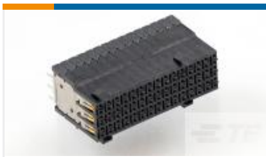
TE Part # 5120791-1 ZP HS3 DB 10R REC 050P CT PD